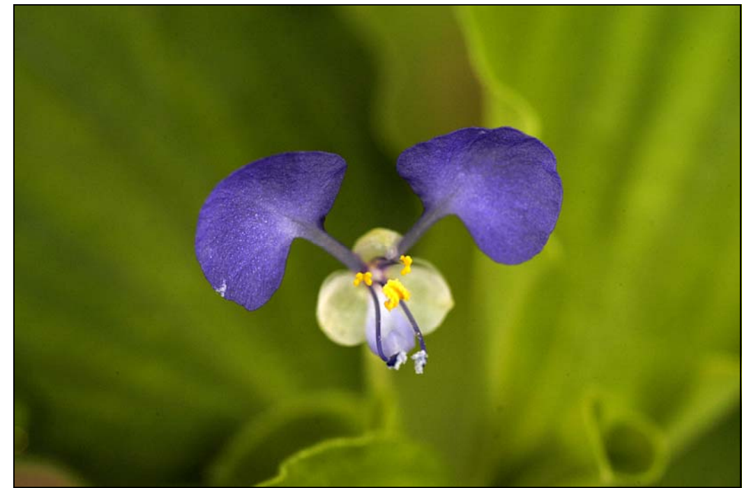
Fig. 5. Purple-blue aerial flowers (chasmogamous) of Benghal dayflower ( Commelina benghalensis L.).