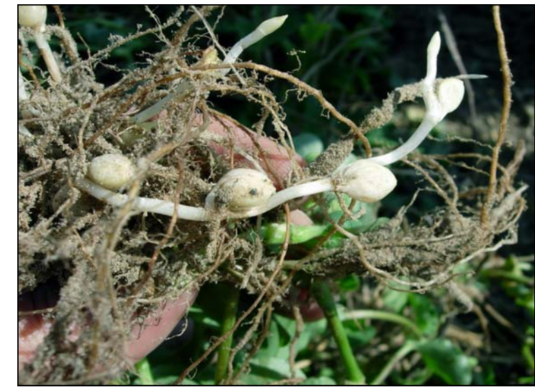
Fig. 2. Underground stolons and subterranean flowers (cleistogamous) of Benghal dayflower ( Commelina benghalensis L.).