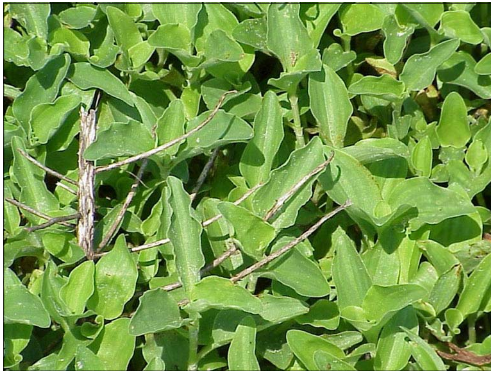
Fig. 3. Leaves of Benghal dayflower ( Commelina benghalensis L.) showing leaf shape and arrangement.