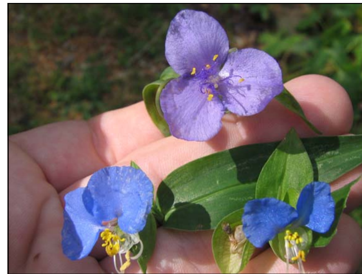
Fig. 1. Ohio spiderwort ( Tradescantia ohioensis Raf.), a true spiderwort (top center) compared to two flowers of Asiatic dayflower ( Commelina communis L.), a true dayflower (bottom right and left). Notice the blue color and variable shape of the petals and the narrow leaf of the Asiatic dayflower.